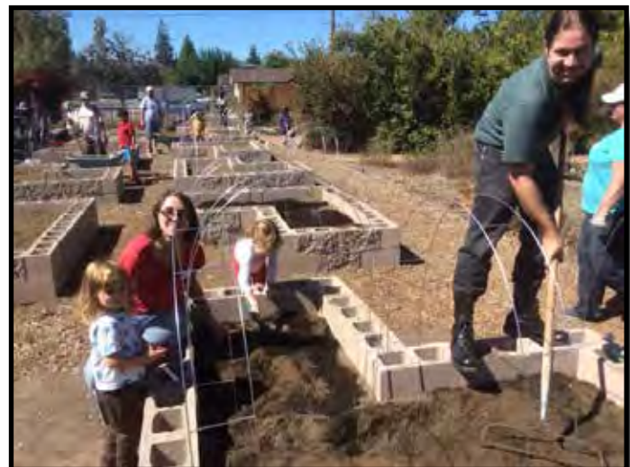
Workday volunteers filled the new garden beds with soil