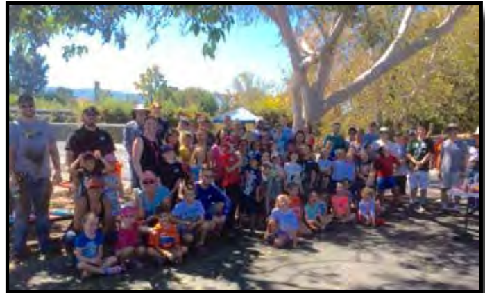
Thank you to our September outdoor workday volunteers