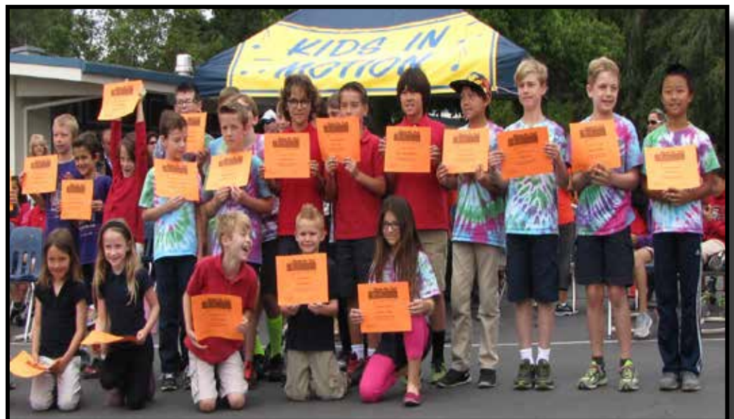
Students are recognized for walking 20 miles or more.