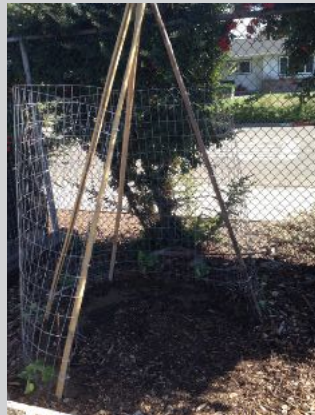
SECRET HIDEAWAY The beginnings of our bean teepee!

A new secret hideaway has been added to our Hacienda Homestead- a bean teepee! We are trying something new by planting crawling bean plants at the base of several poles and wire to create a woven tapestry of leaves, vines and of course- tasty beans! Keep an eye on it as you walk past the chickens to see it's progress!