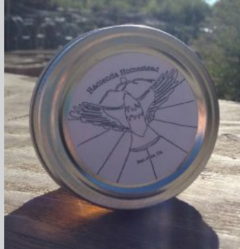
HACIENDA HARVESTED HONEY Come get your honey before we run out for the year!

your honey before we run out for the year!