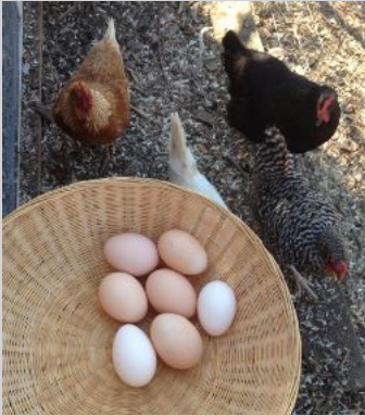
FRESH EGGS FROM THE HACIENDA HOMESTEAD We love our chickens and their eggs!

As the day length grows shorter, and the nights grow colder, the hens will begin to lay less eggs. A hen lays one egg for every 14 hours of daylight she experiences. This is why some large scale egg layers put lights in their coops- to extend the laying season into the Fall and Winter. The Fall Equinox doesn't mean we will no longer get eggs, it just means we will be getting less eggs. You might also notice large amounts of feathers on the floor of the chicken coop. This is due to molting, which occurs in the Fall. When a hen molts, her egg production decreases.